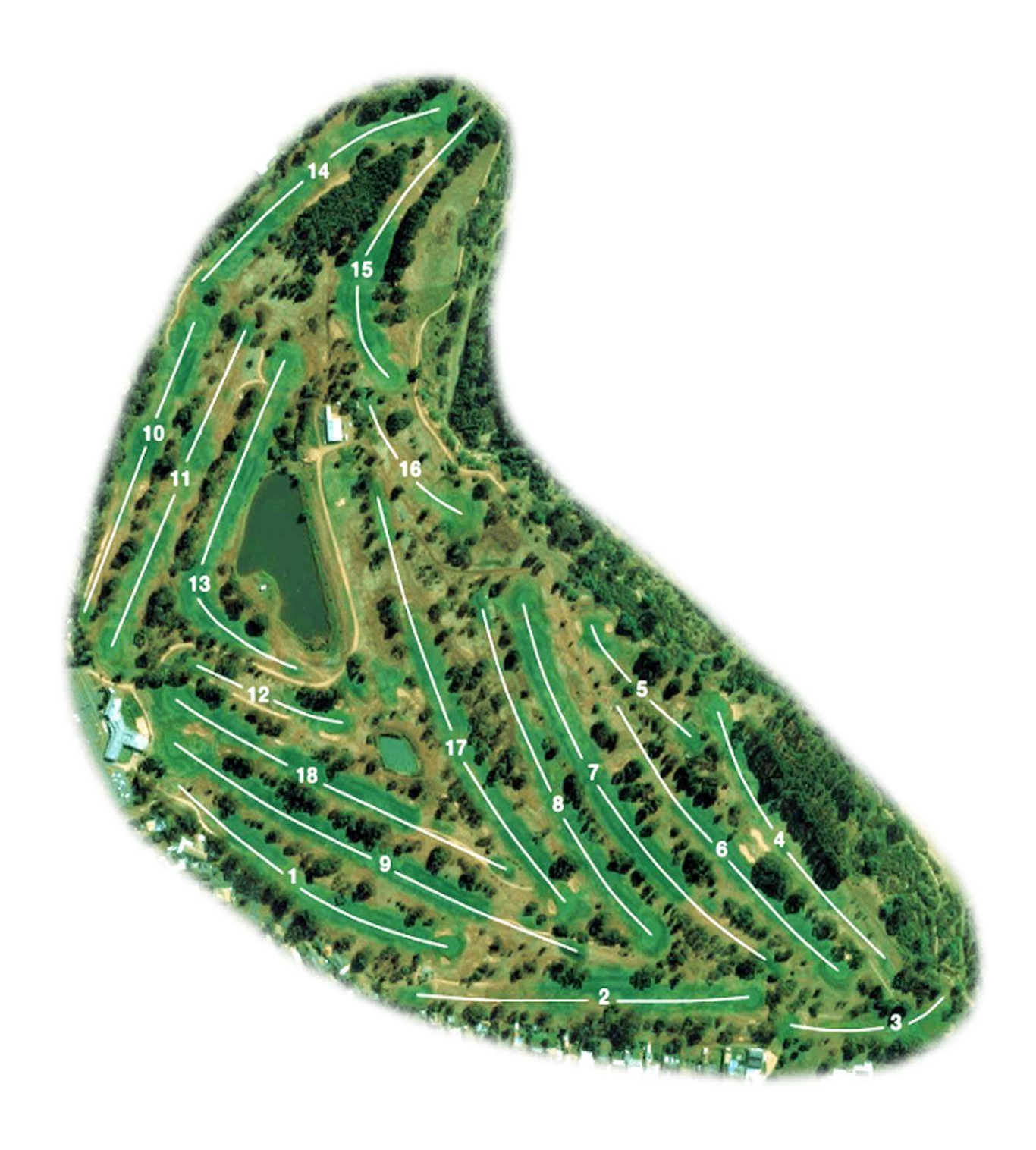
Bacchus Marsh Golf Club