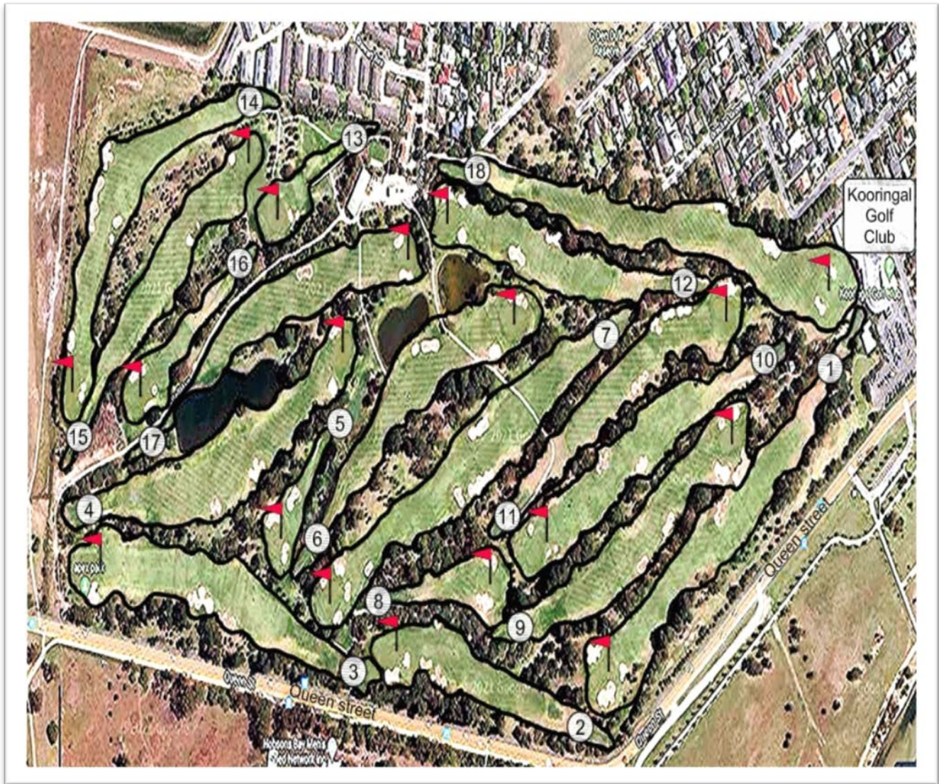
Koorringal Golf Course