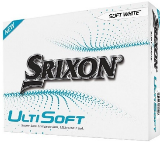
Srixon Ulti 4 Soft Feel White: $25 Per Dozen