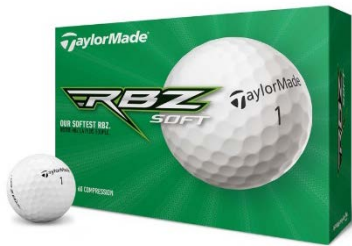
TaylorMade RBZ TM 21 Soft Feel White: $25 Per Dozen