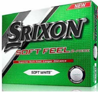
Srixon Soft Feel White: $25 Per Dozen