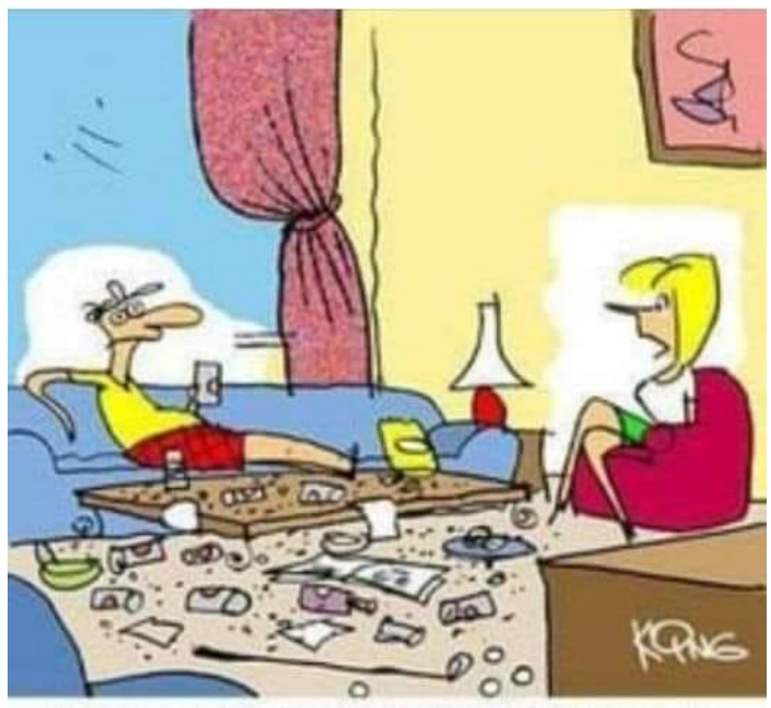
"Remember I said I wanted you to stop golfing so you could spend more time at home? Well if you don't mind, I'd like you to go back to golfing."