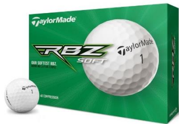
TaylorMade RBZ TM 21 Soft Feel White: $25 Per Dozen