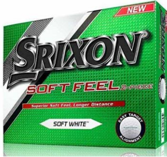
Srixon Soft Feel White: $25 Per Dozen