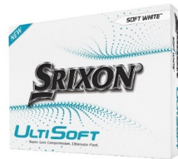
Srixon Ulti Soft White: $25 Per Dozen