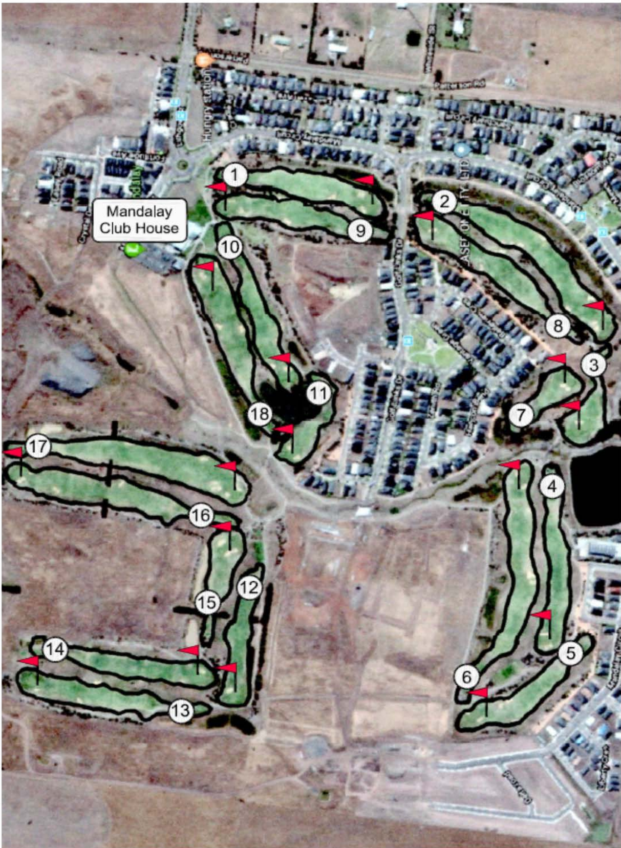
Mandalay Golf Course