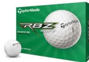
TaylorMade RBZ TM 21 Soft Feel White: $25 Per Dozen