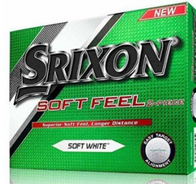
Srixon Soft Feel White: $25 Per Dozen