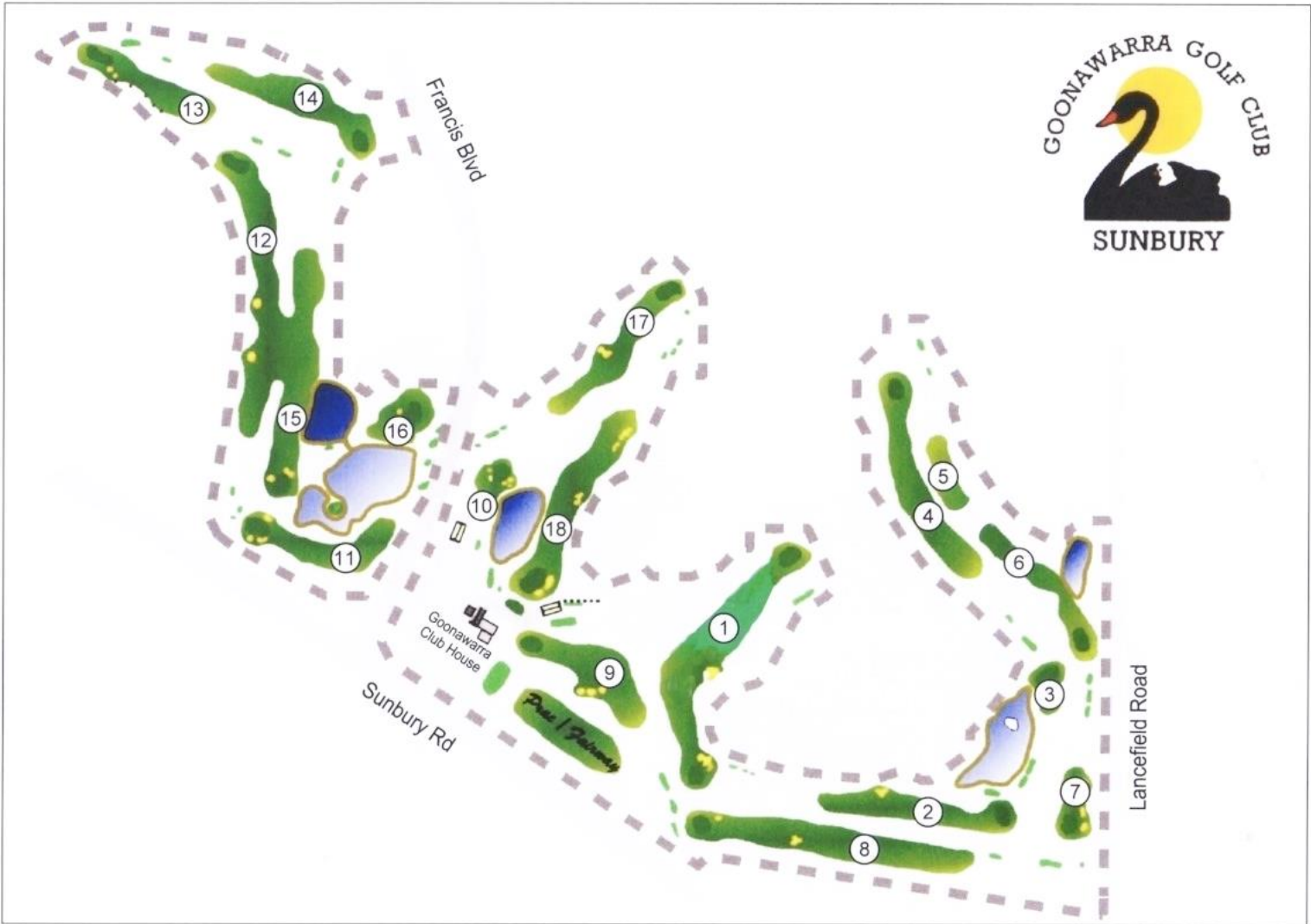
Goonawarra Golf Course