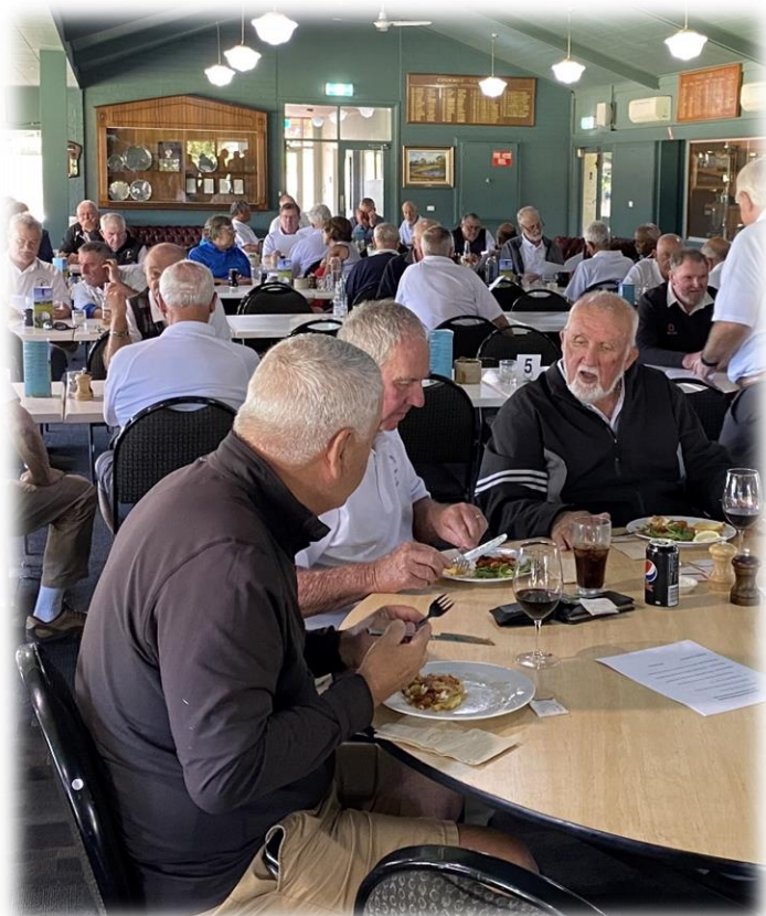
Lunch at the AGM