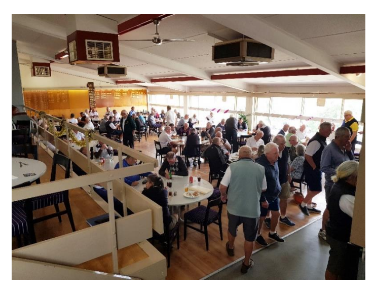
Members enjoying lunch after the Melbourne Airport game.