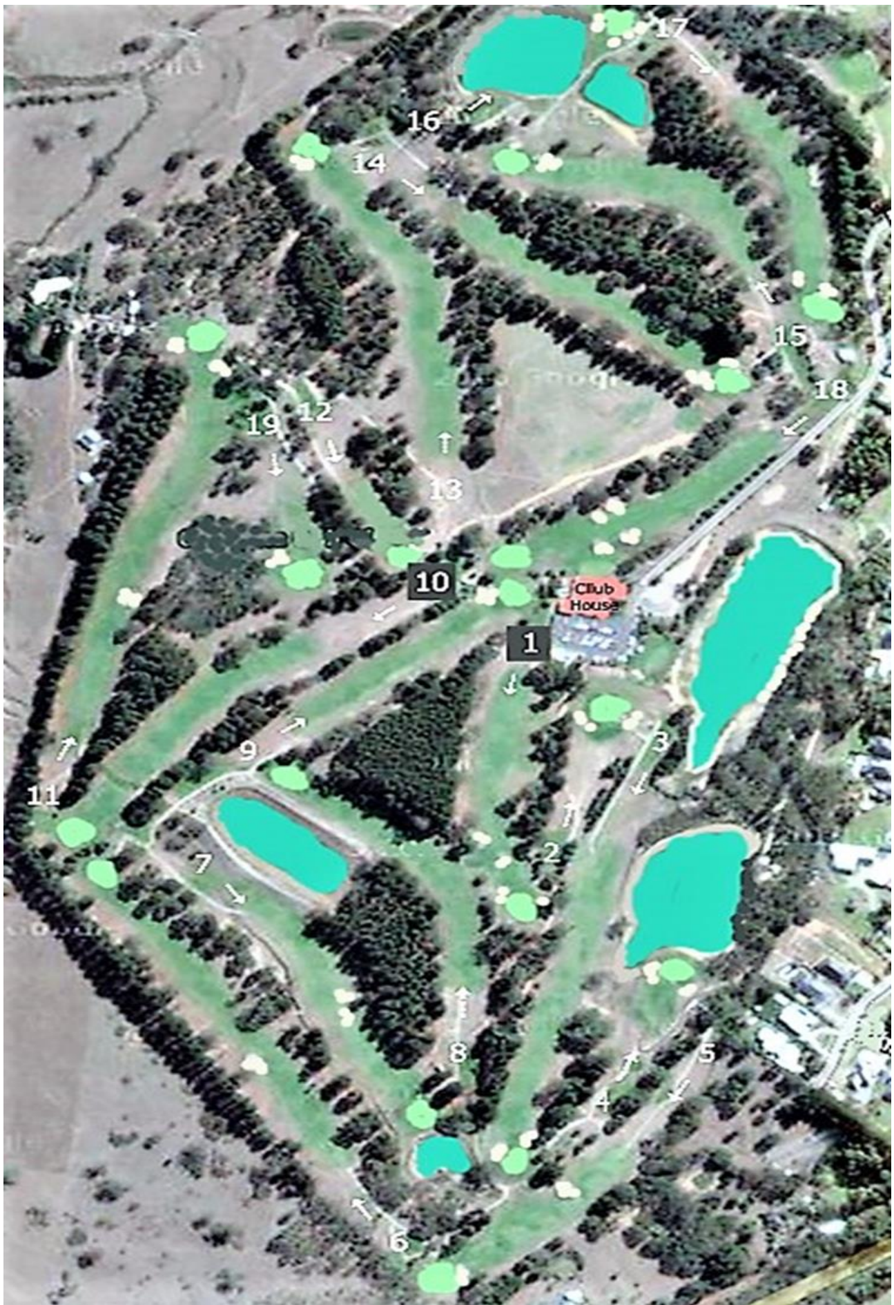
Gisborne Golf Course