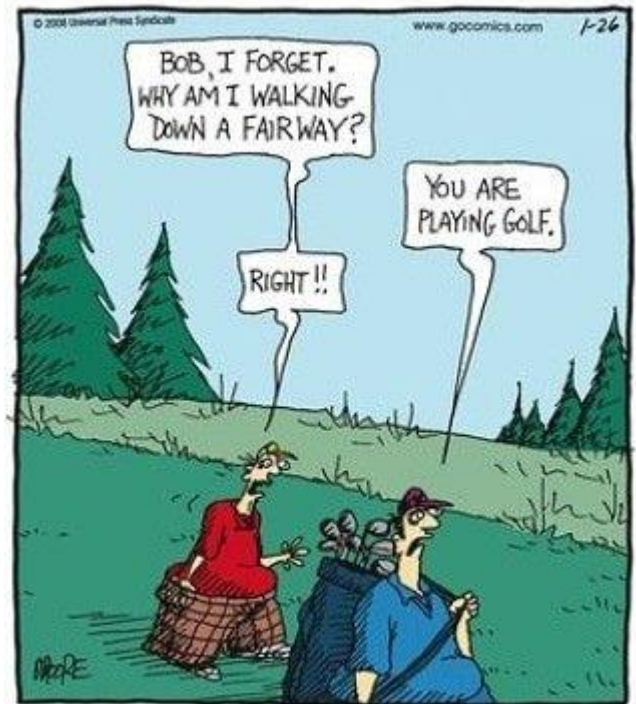
Senior PGA moment.