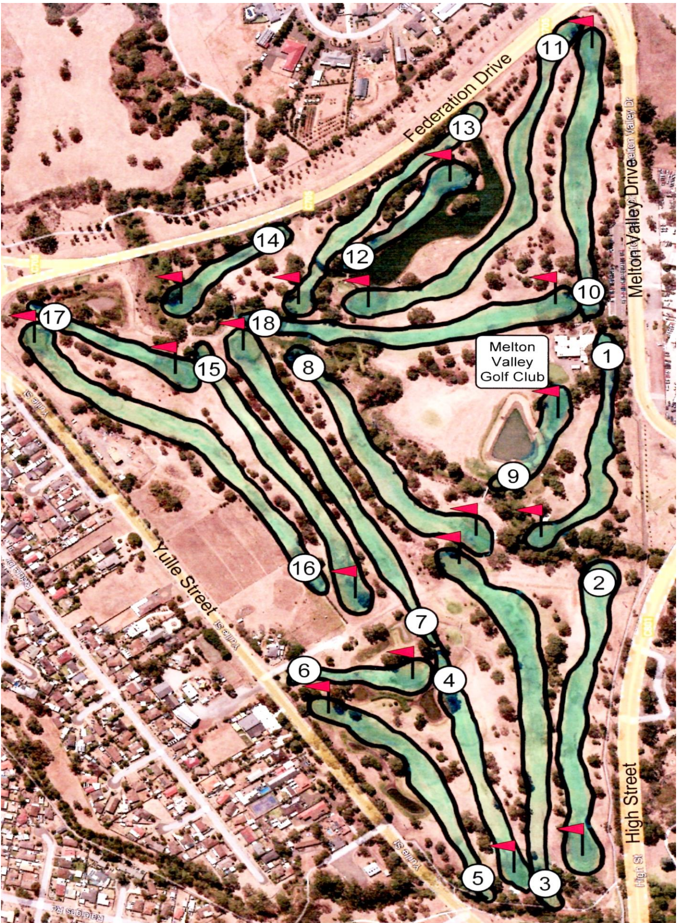
Melton Valley Golf Course