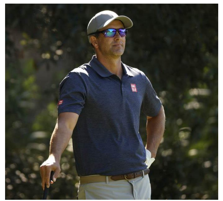
SCOTT AND OTHER STARS FACE FINE FOR SAUDI SWING