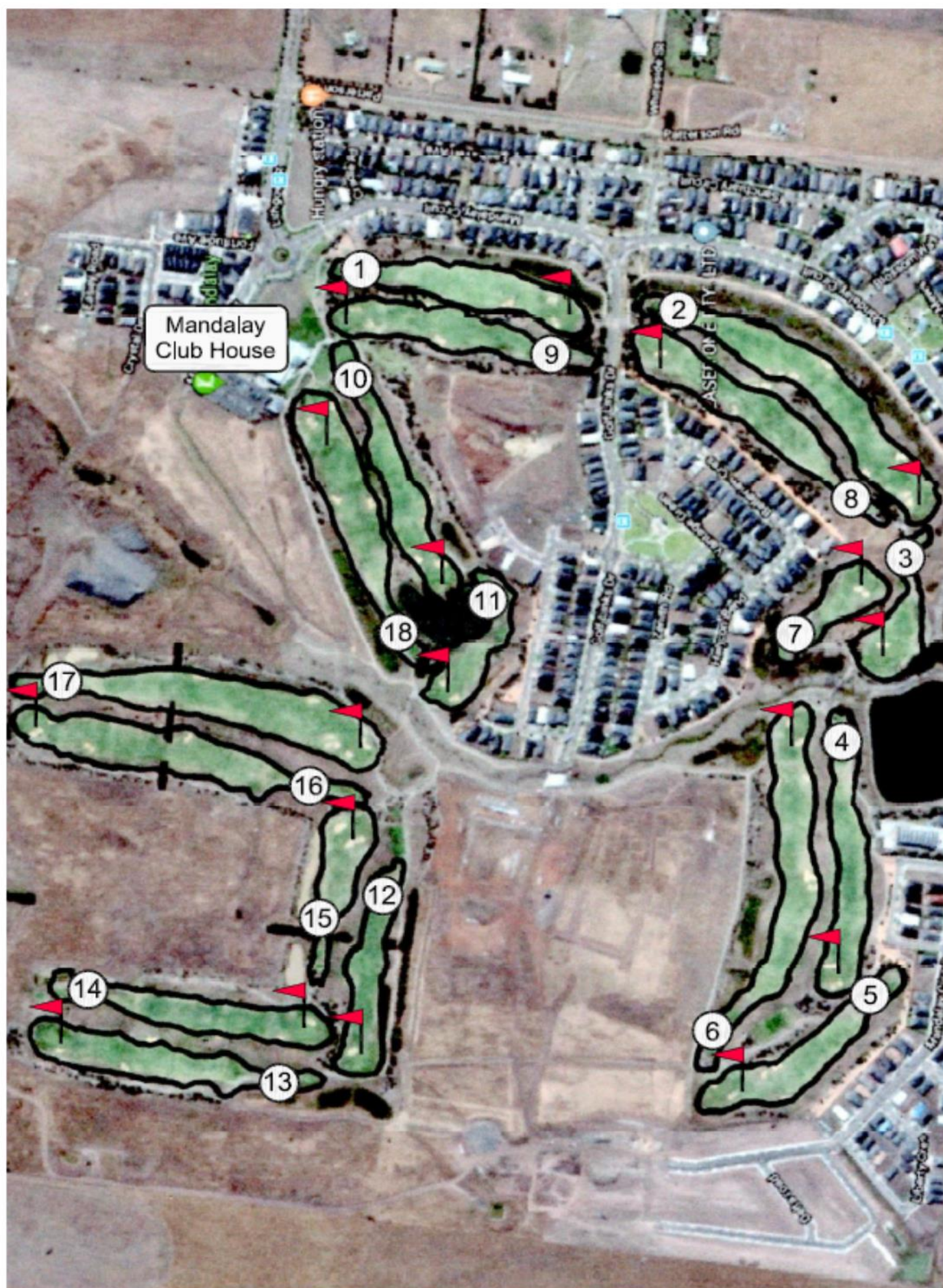
Mandalay Golf Course