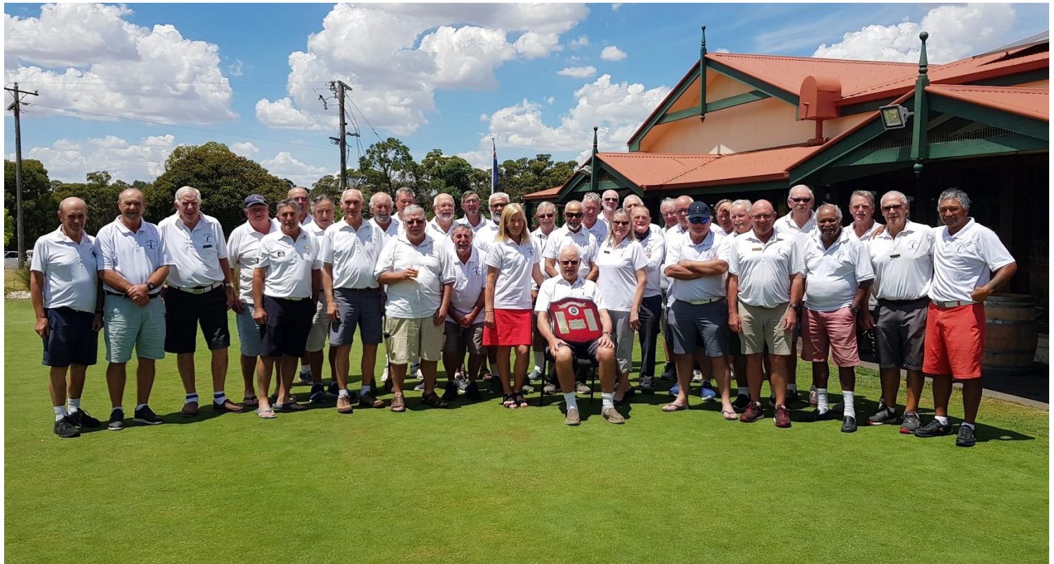
The winning Hume Vets Team (for a short time)