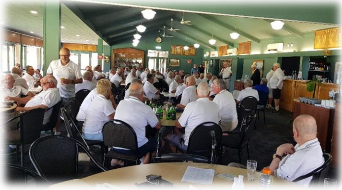
2022 AGM lunch at Gisborne