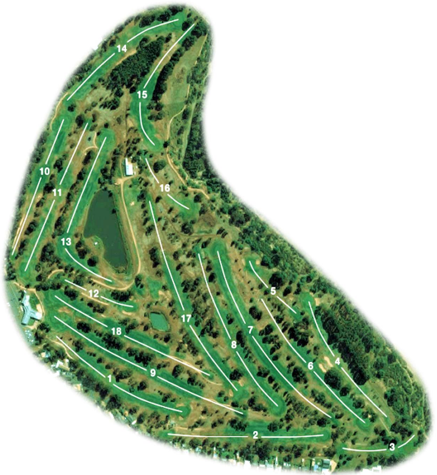
Bacchus Marsh Golf Course