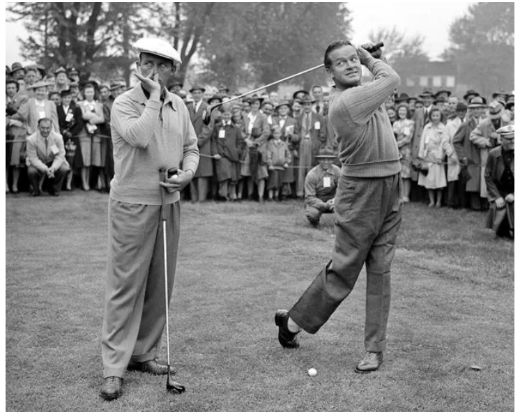
Bing Crosby (left) doesn't appear too impressed with Bob Hope's golf swing, but Hope was an excellent golfer.

Bob Hope played golf with many U.S. presidents over the years. At the Bob Hope Classic, Hope's pairing usually including a former president, often Gerald Ford. And President Ford was infamous for beaming spectators with wayward shots.