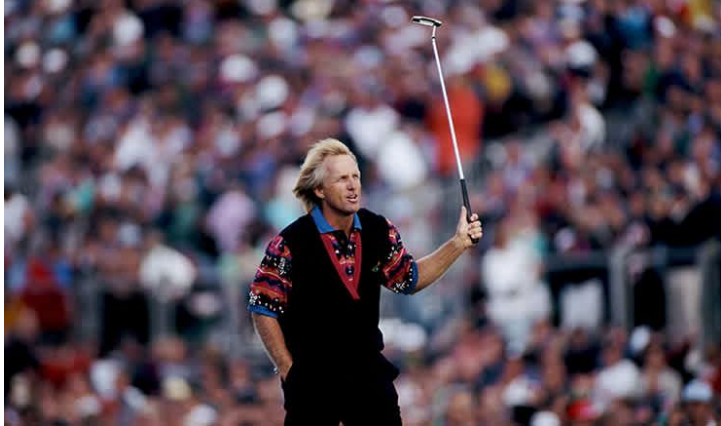
Greg Norman responds to the crowd at the 72nd hole at Royal St George's in 1993.