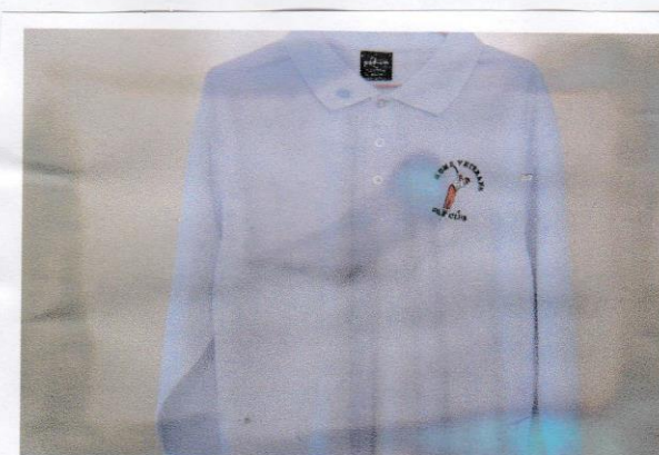
LONG SLEEVE SHIRTS $30

ORDER WITH ALAN KINNAIRD MOBILE 0418564760