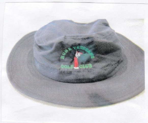
FLOPPY HATS $20