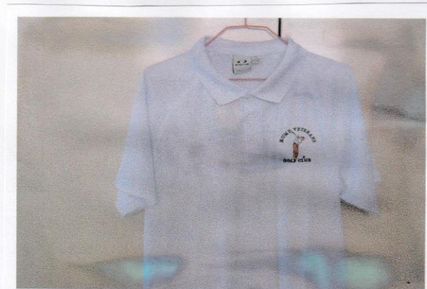
SHORTS SLEEVE SHIRTS $25