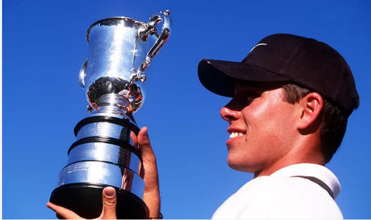
Aaron Baddeley celebrates his 1999 Open win at just 18 years old.

Three weeks after he completed his year 12 exams, Aaron Baddeley went and won an Australian Open.