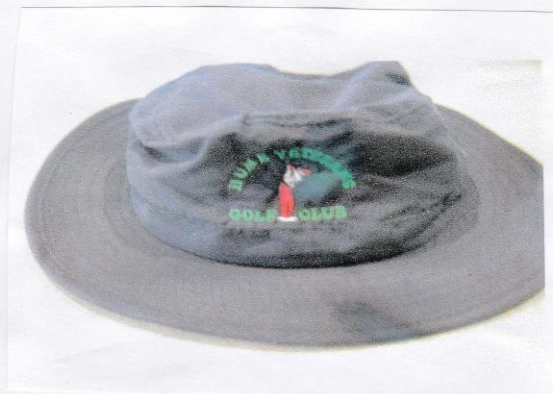
FLOPPY HATS $20