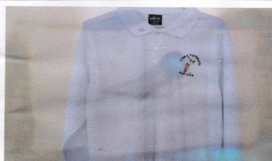
LONG SLEEVE SHIRTS $30

ORDER WITH ALAN KINNAIRD MOBILE 0418564760