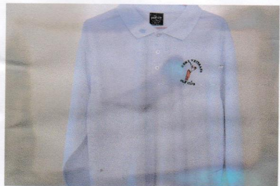
LONG SLEEVE SHIRTS $30

ORDER WITH ALAN KINNAIRD MOBILE 0418564760