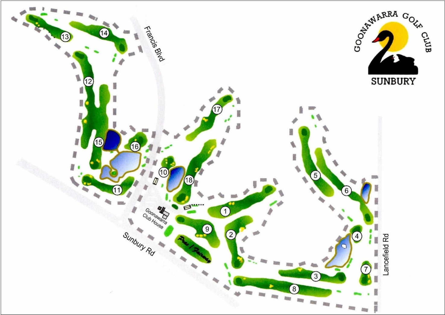
Goonawarra Golf Course